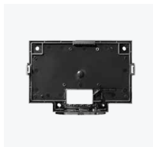
Docking station for PoE data line without «option door control»