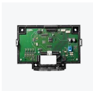
Docking station with 24 V DC