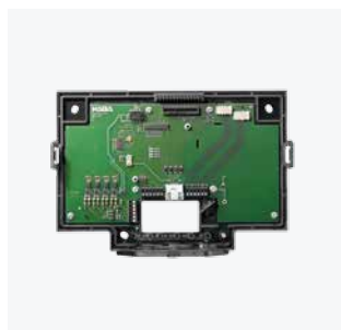
Docking station for PoE data line with «option door control»