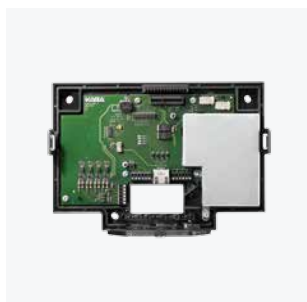
Docking station with 230 V AC