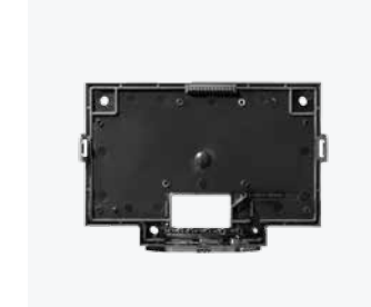
Docking station for PoE data line without «option door control»